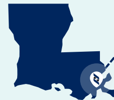
New Orleans, LA Touro Medical Center